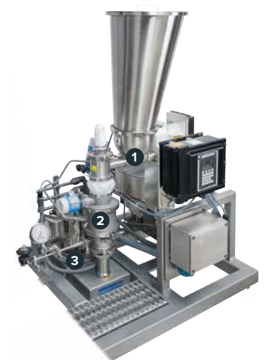
Continuous inline dispersion set-up: 1. Continuous feeder, 2. Uniform film interface (UFI) 3. ZC Powder Dispenser.