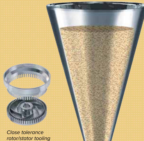
Close tolerance rotor/stator tooling

The advanced design of the ZC Dispenser's rotor/stator reactor provides intense shearing of powders prior to hydration. This leads to homogeneous suspensions free of lumps and "fish eyes".